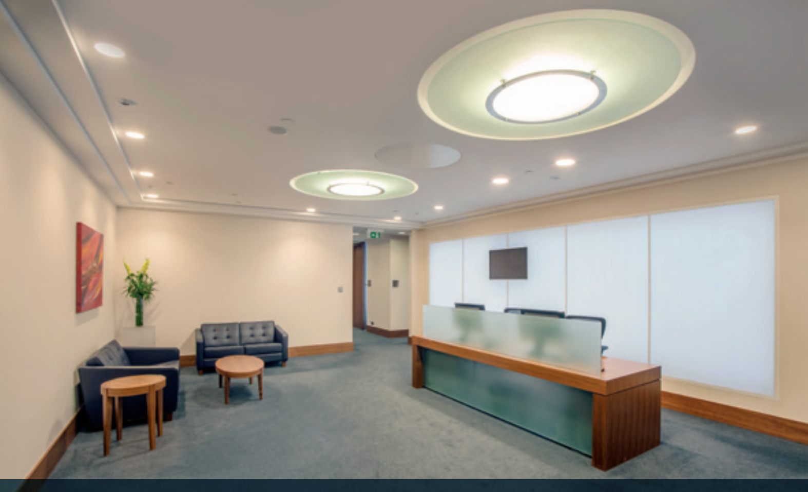
Office upgrades Financial Institution, Canary Wharf, London